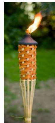
Tiki lights are available at most pound shops or hardware stores.