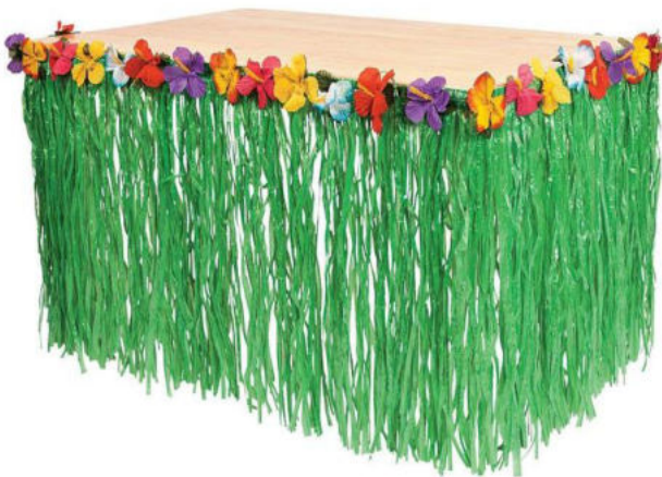
Give your tables a more festive touch by adding grass skirts and flowers (thin strips of green plastic bags and flowers from any pound shop).